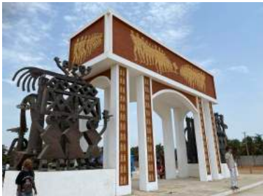
The 'Gate of No Return' - Slavery Memorial in Ouidah

I was not sure quite what to expect on arrival in Benin. Stepping off the plane I was greeted with a wall of heat and a place full of life and contrast. French is the main language but there are many other tribal languages in use. The current President is overseeing a serious program of development in the country which has seen major changes for the better. However, poverty, corruption, crime, and poor infrastructure are still common place. I was very pleased to be under the care of local brethren and with Jean-Claude who has been visiting the country for over 30 years!