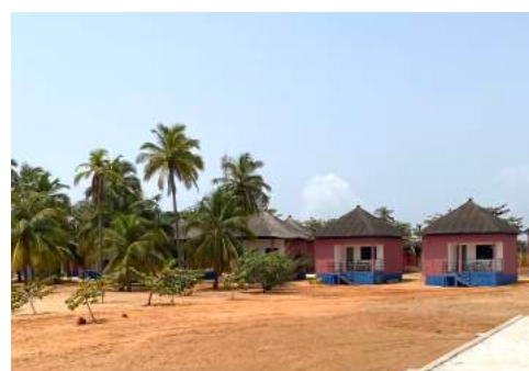
Part of the Conference Complex at Ouidah

Around 100 people gathered in Ouidah for four days of ministry. Some brethren also came from Togo and Ivory Coast.