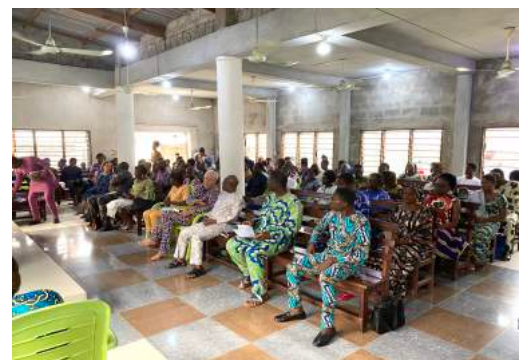
Grace Church in Zogbo