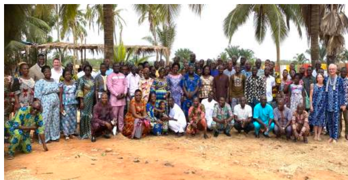
Some of the delegates at the Grace Conference

preaching meetings, additional Bible studies, men's and women's meetings, prayer times and discussions. The Lord was pleased to make the Conference a special time, the fellowship was rich, and many were deeply impacted. There was also a book stall with many of the Europresse titles available including the new release! It was wonderful to see the enthusiasm for the books and many went away with additions to their library!