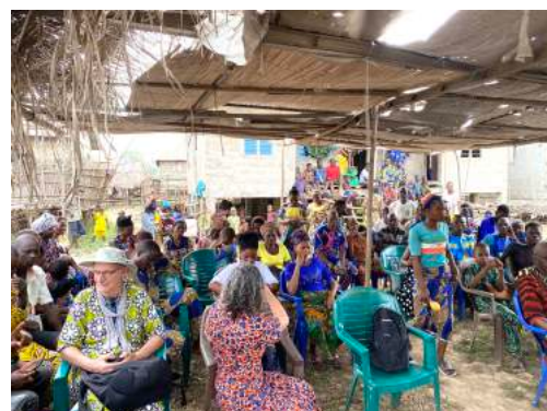
Village Outreach Meeting

hear the Gospel preached. And people came! These meetings were followed by the provision of a meal or refreshments by the host family - often at great cost to themselves. However, there was a desire to see people confronted with the truth of Christ and sovereign grace. On one of the mornings, we started early from Porto Novo to get a boat down the river